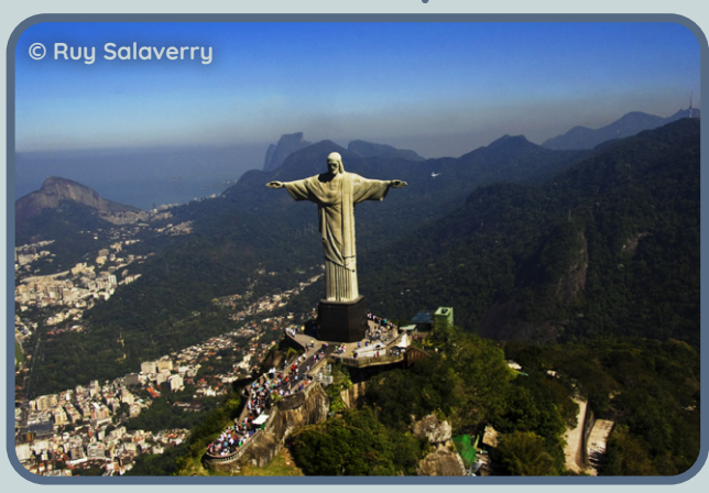
Rio de Janeiro landscapes